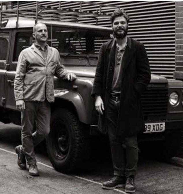
For further press enquires, details about LASSCO, images, Ropewalk and individuals please contact Frankie Reddin: